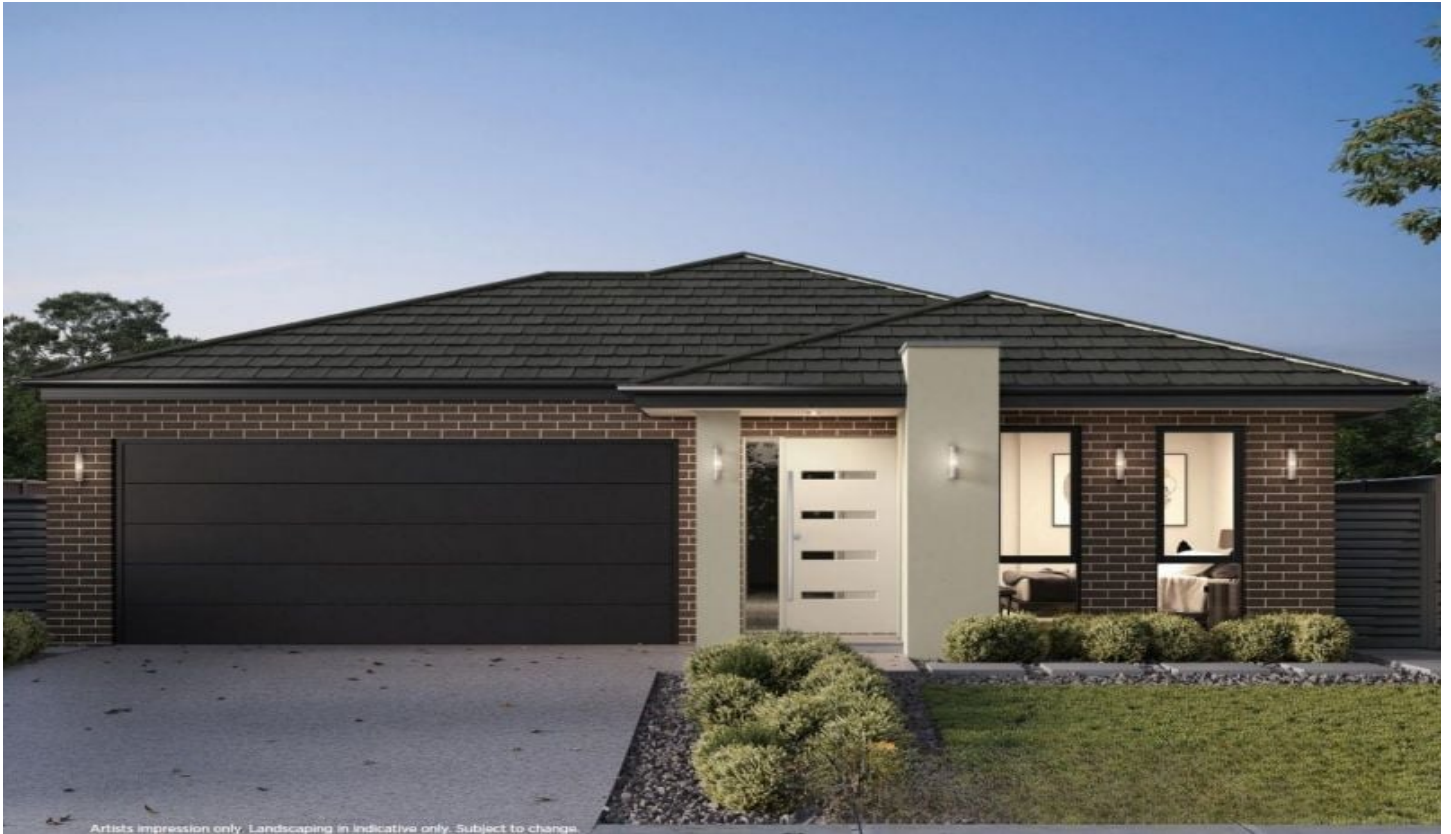
Artists impression only. Landscaping is indicative only. Subject to change.